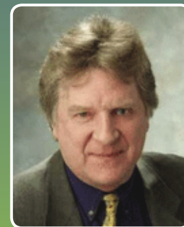
Dr. Robert Thurman